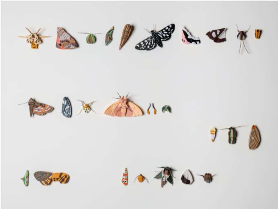
Nibha Sikander, Entomology Script 1, shows the transitory nature of sentient life tarq.in

Through a mesmerising assemblage of mixed media including silkscreen prints, photography, basalt rock and ballpoint on paper, Ephemeroptera encapsulates our anxiety to salvage what we can from inevitable loss and encourages visitors to muse upon their own fragility in a constantly changing world.